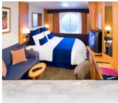
Ocean view cabin $3,695

per person double occupancy sharing an Inside cabin