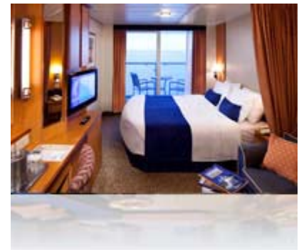
Ocean view private balcony $4,795

per person double occupancy Sharing an Ocean View Cabin