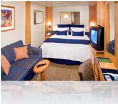
Inside cabin $3,495

per person double occupancy sharing an Inside cabin