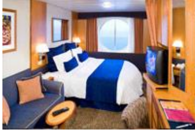
Ocean view cabin $5,990

per person double occupancy sharing an Inside cabin