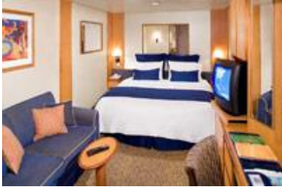
Inside cabin $5,790

per person double occupancy sharing an Inside cabin