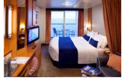
Ocean view private balcony $7,090

per person double occupancy sharing an Ocean View Cabin