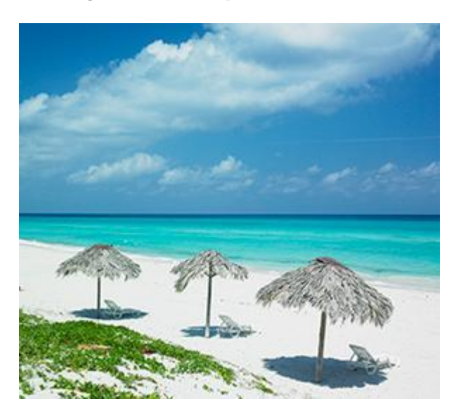
Day 5 – George Town, Caymen Islands – 8.00am to 3.00pm

Overnight aboard ship – All meals aboard ship included